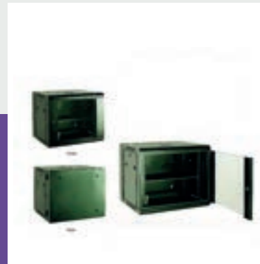
Fully Assembled and Disassembled Wall Mounted Cabinets