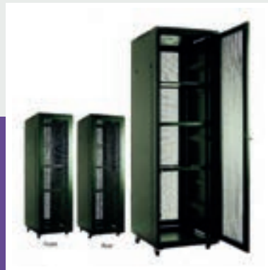
Server Cabinets and Racks